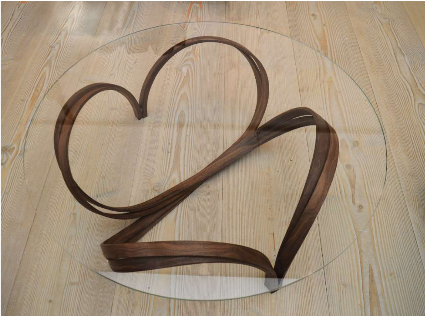
Table Basse Éclosion

Noyer d'Amérique, Verre American walnut, Glass