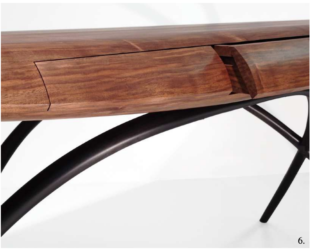
5. Vesta Secretary Desk