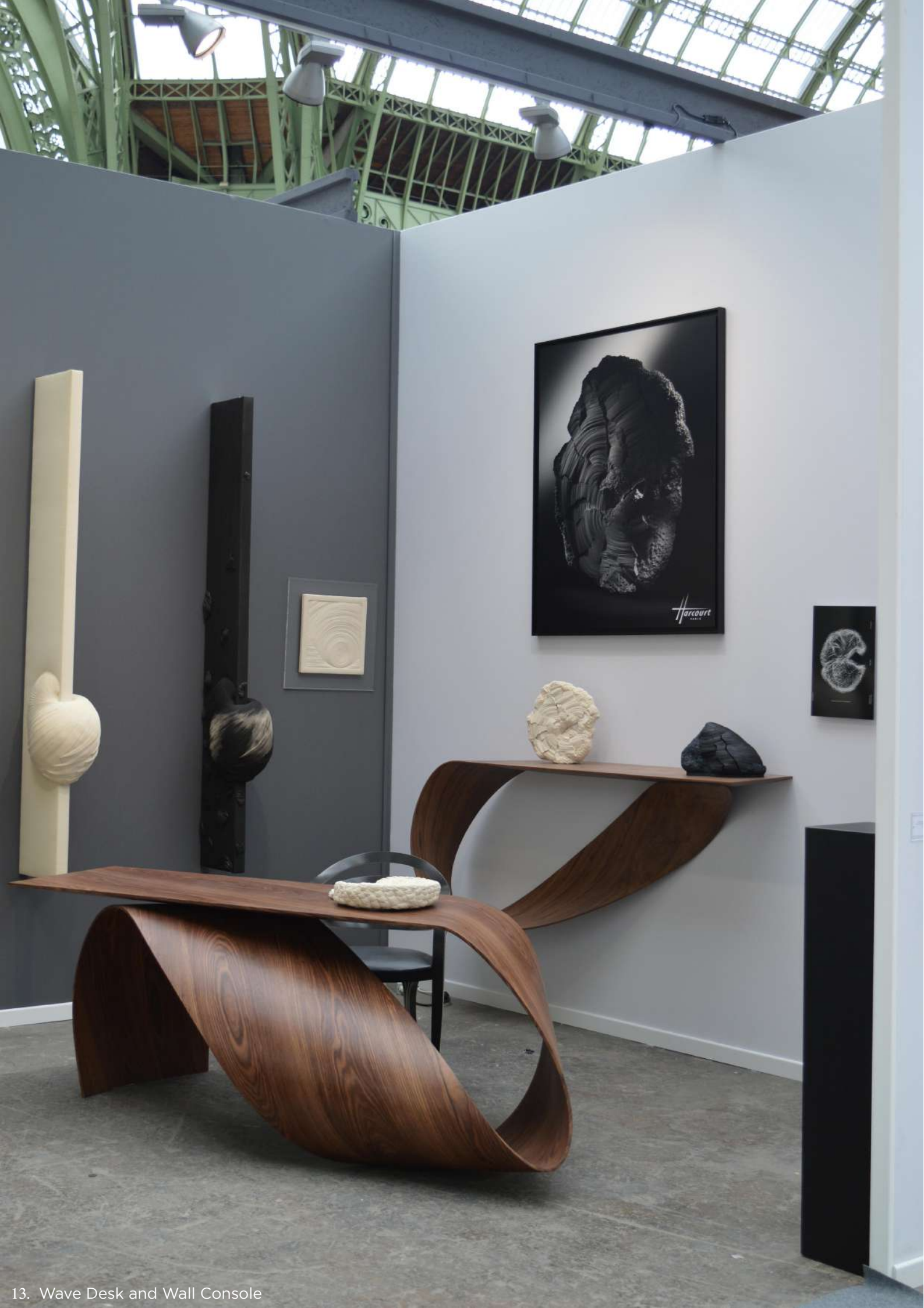
13. Wave Desk and Wall Console