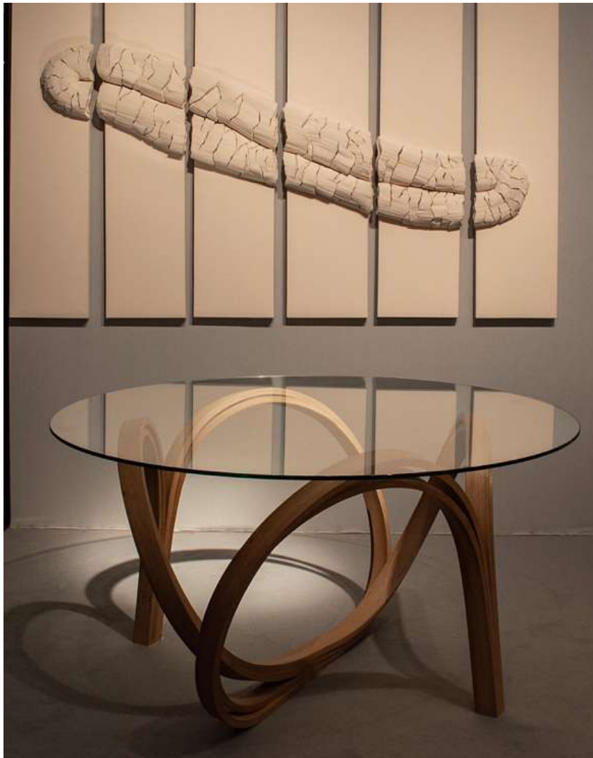
Table Salle à Manger Éclosion

Noyer Américain, Verre American walnut, Glass