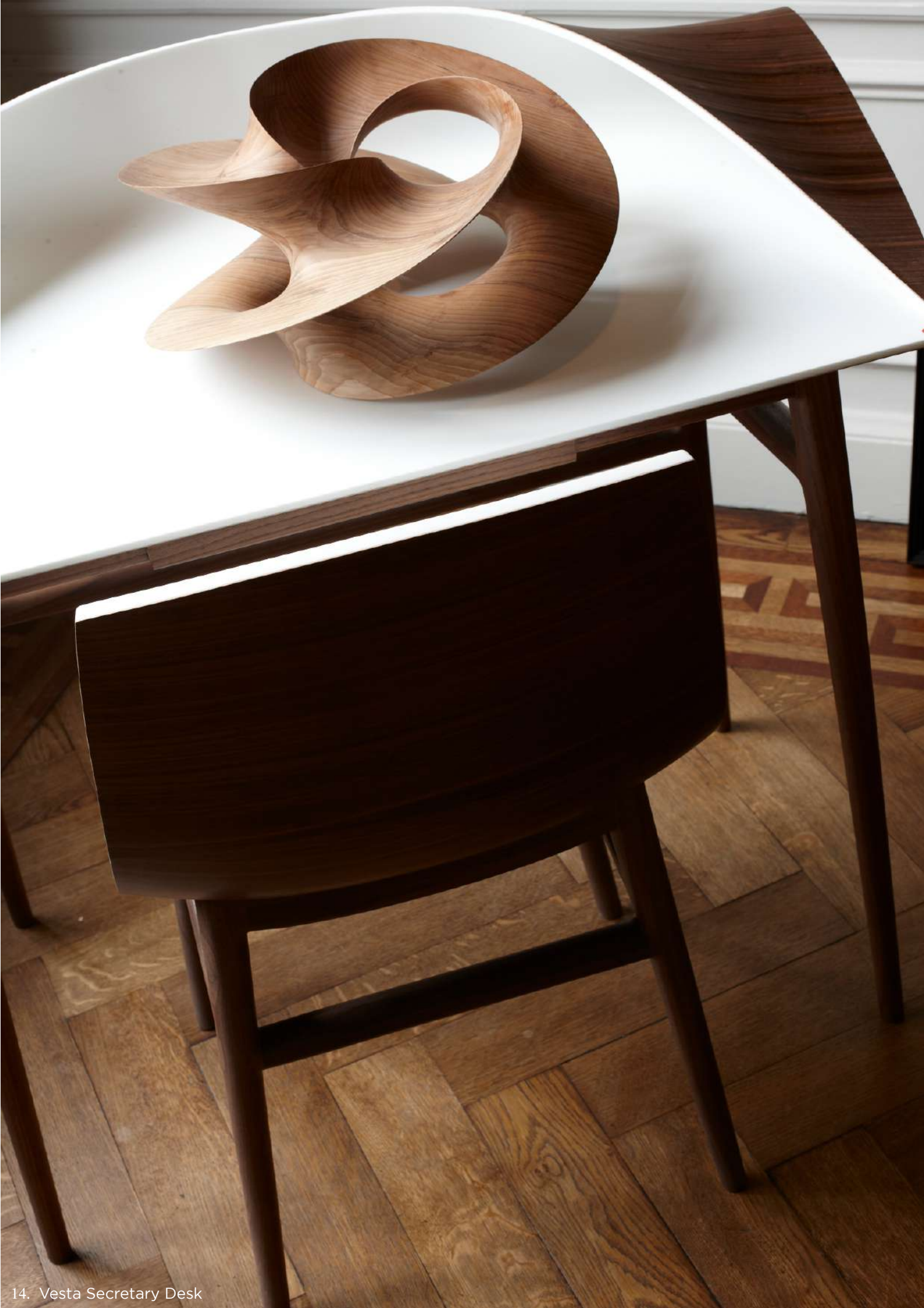
14. Vesta Secretary Desk