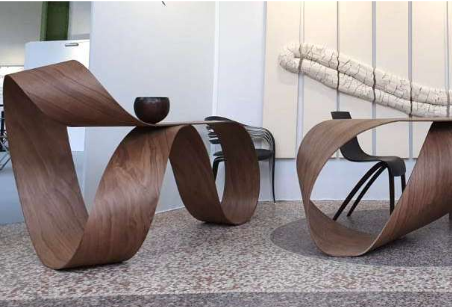
Möbius Console, American Walnut Révélation Fair 2019, Grand Palais, Paris