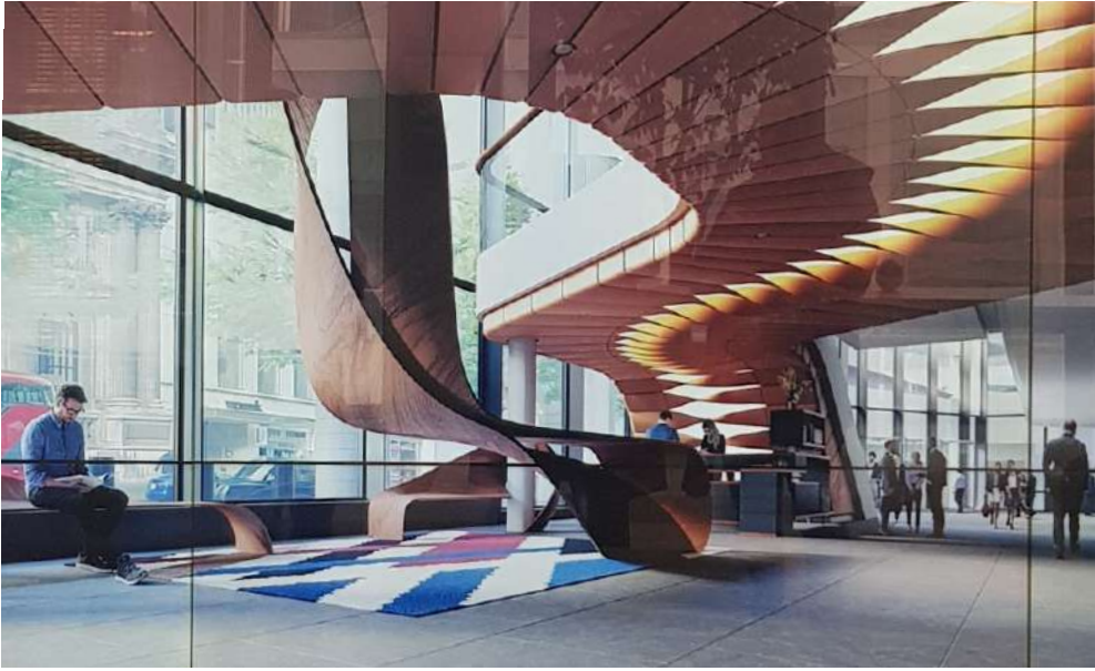
7 XXL creations for the 22 Bishopsgate Building Lobby, London City.