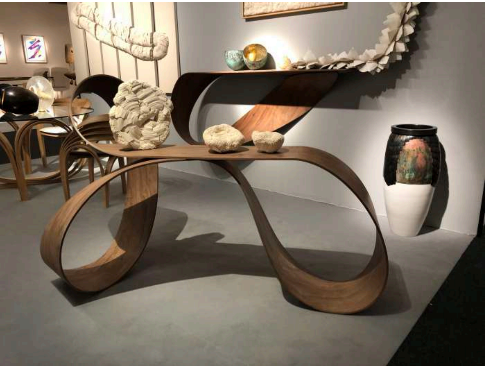
Möbius Console, American Walnut PAD Paris 2019, Tuileries Gardens, Paris