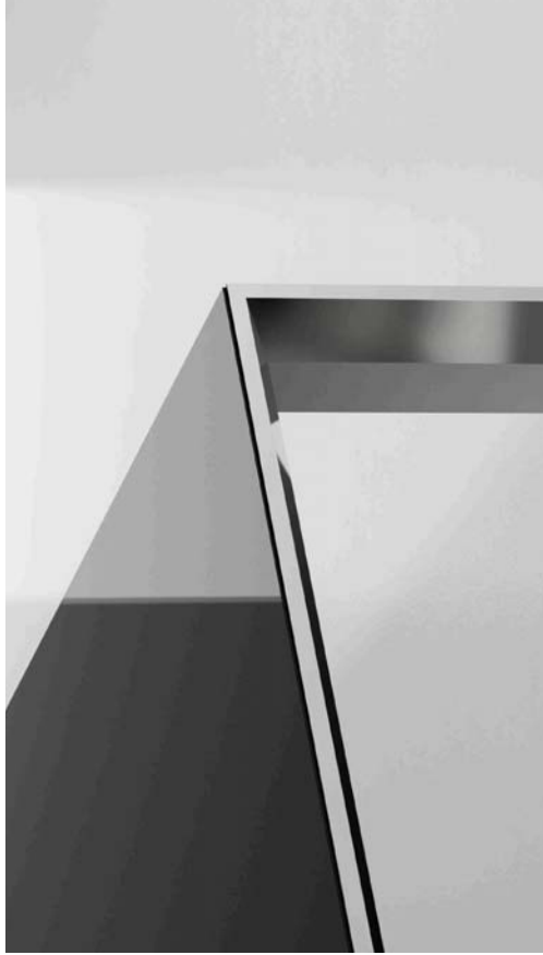
RATIO IN POLISHED STAINLESS STEEL AND BLACK BACK-PAINTED GLASS