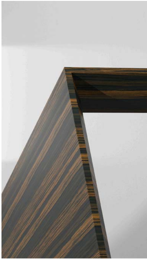
RATIO IN EBONY #502