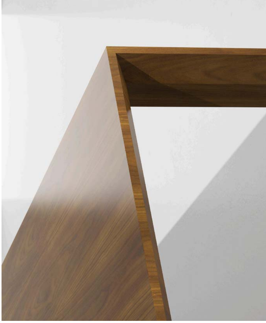
RATIO IN FLAT-CUT WALNUT #125

Designed by Brian Graham, the Ratio table reinvents the classic farm table in modern form, accommodating purpose and function in a straightforward manner that makes clear the merits of decorum, the value of fine materials and the enduring value of the table as a place to gather, connect and celebrate. "An elegant table," says Graham, "is a tangible presence, a surface and a site that invites us to participate, to converse, to exchange ideas and form alliances. It is an icon of transaction and esprit de corps." Robust yet refined, the beauty of this simple table is testament to the craftsmanship and veneer artistry of Decca Contract.