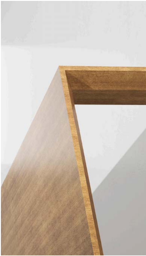
RATIO IN QUARTER-CUT NATURAL OAK #126