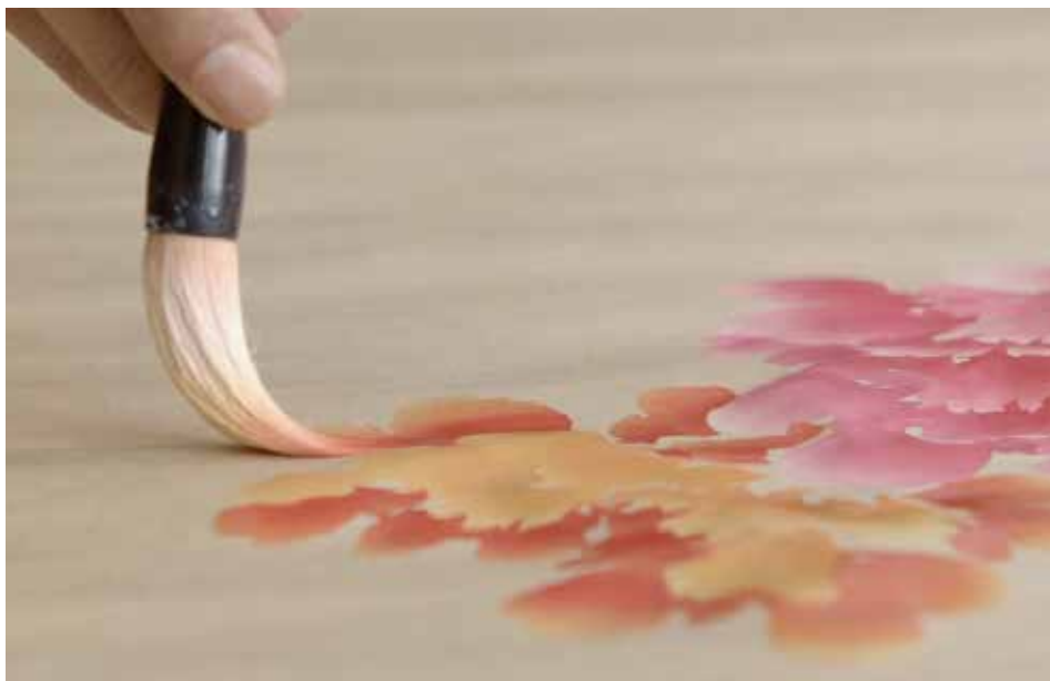
FRONT COVER IMAGE Close-up of Nonsuch in Moghul

With the passage of time, the most accomplished artists achieve a status of painting skill which allows a more free and spontaneous approach to their work. They combine the precision and detail learned in formal painting, with the subtle control of traditional calligraphy to render natural forms with a single, gestural brushstroke. Our 'Unconscious' style is a demonstration of artistic flair and finesse, the painting of a true master.