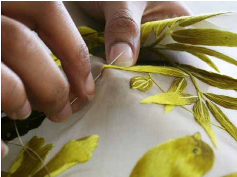
ABOVE IMAGE Close-up of hand-embroidery of Paradiso in Custom Colour on Organza RIGHT-HAND IMAGE Close-up of hand-embroidery of Paradiso in Blood Olive

The silks are first hand-painted before being stitched onto a frame and embroidered with unspun silk and metallic threads. The finest embroideries have been produced in Suzhou for 2500 years, with skills and techniques handed down through generations. It is here that Fromental's embroiderers spend up to 600 hours embellishing individual panels. The embroidery is entirely by hand, using traditional techniques as part of our commitment to ensure sustainability of this ancient craft.