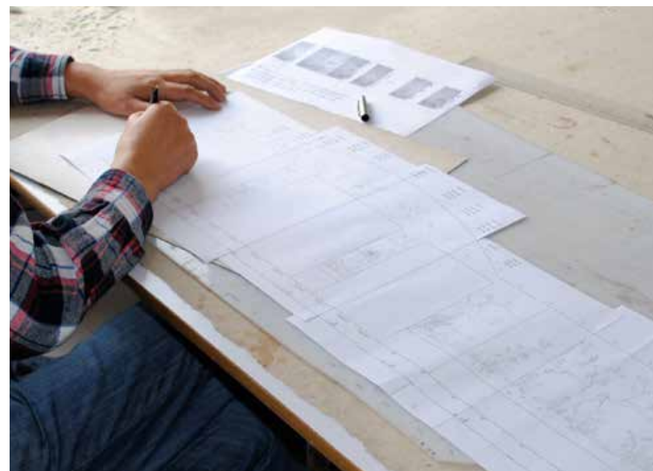
ABOVE IMAGE Close-up of miniature drawing

Here is an example of a Chinoiserie design that has been customised in both layout and colourway to fit the client's space. The miniature plan and roomshot illustrate how additional birds and design elements have been used to tailor the room, accommodating both the staircase and double height ceiling.