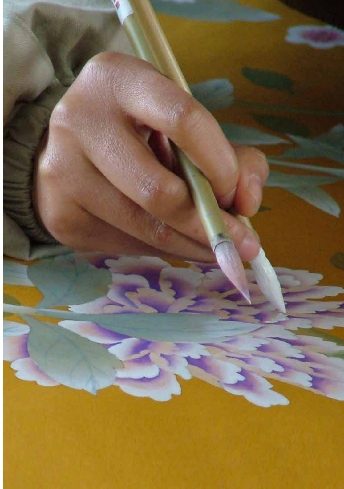
RIGHT-HAND IMAGE Close-up of hand-painting of Paradiso in Panama on Panama Silk