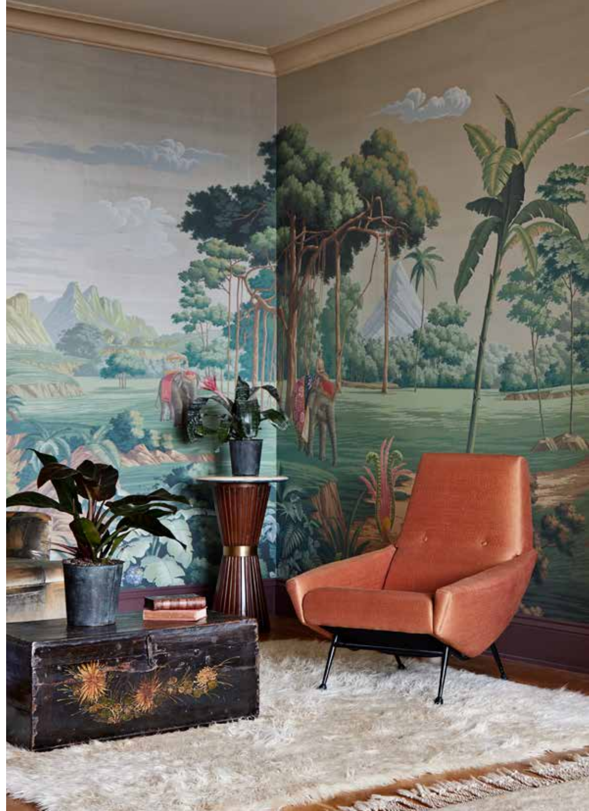
ABOVE IMAGE Keats in Furrow Photo credit: Antiques supplied by Lorforde's Antiques RIGHT-HAND IMAGE Shimla in Custom Colour

The designs within this collection lend character to any room; whether it be a subtle backdrop or unashamedly maximal feature.