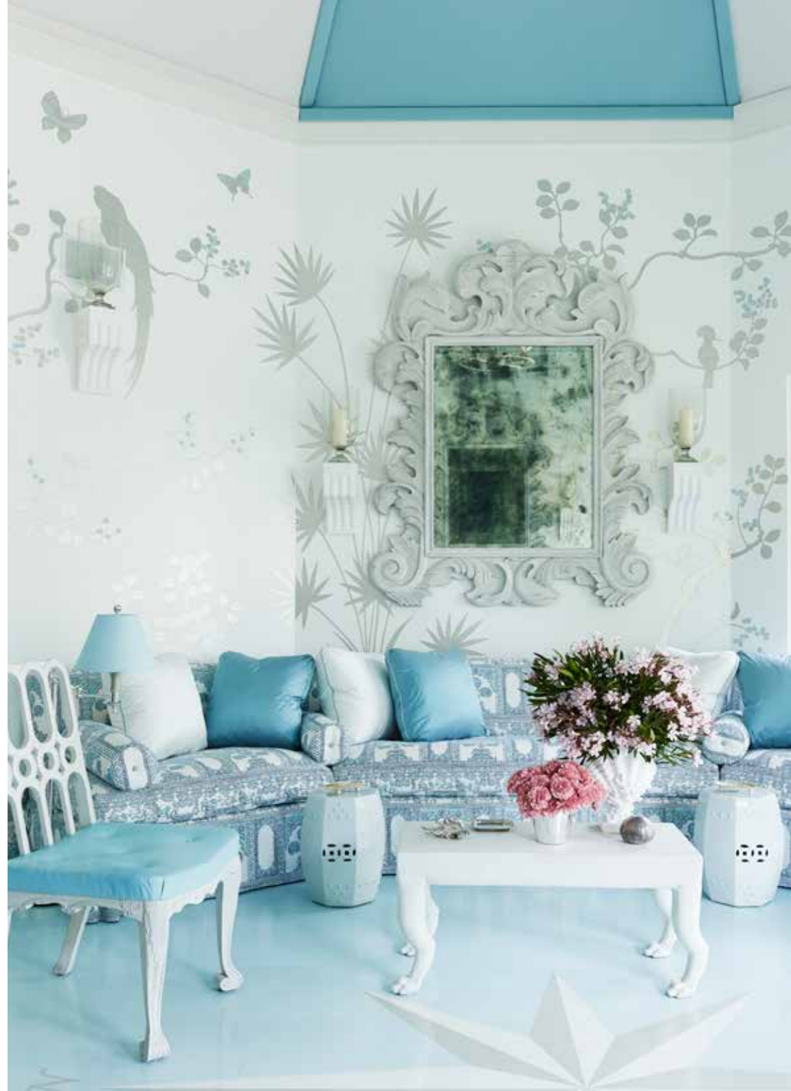
ABOVE IMAGE Willow in Custom Colour RIGHT-HAND IMAGE Chinon in Custom Colour on White Silk Interior Design by Miles Redd