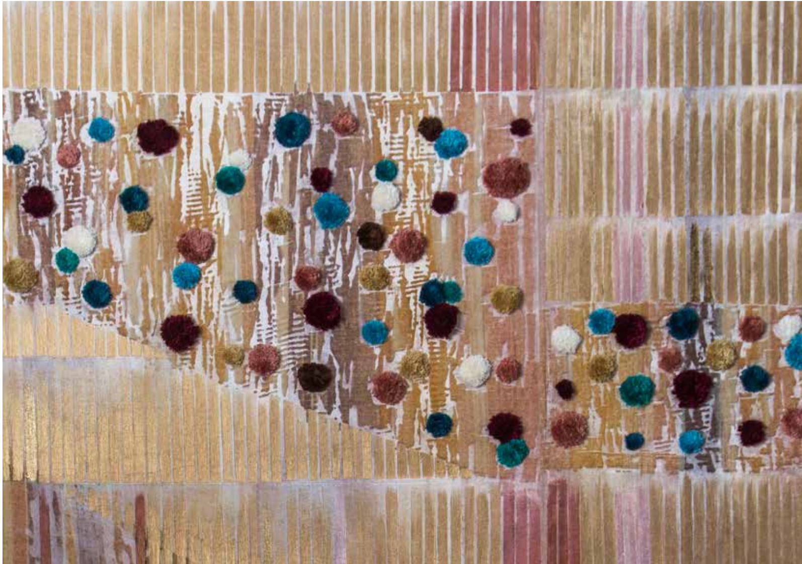
Goldoni in Vienna