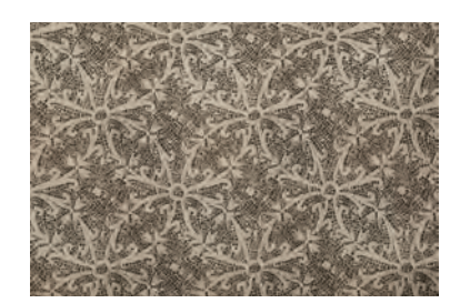
P6472 Esplanade | Greystone