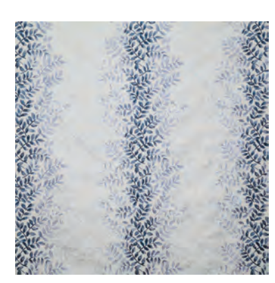
7125 Hojas | Sapphire