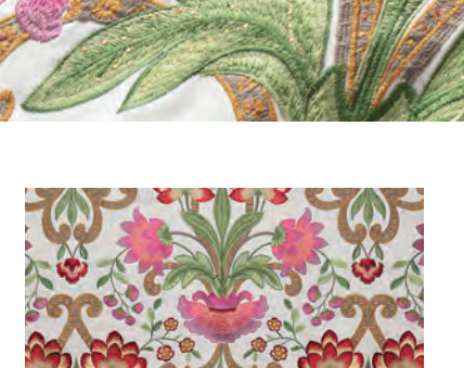
7127 Alameda | Botanica