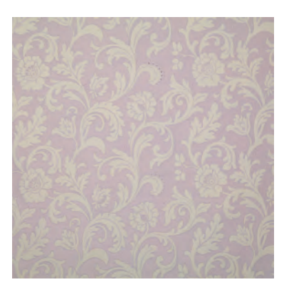
7123 Renacimiento | Lilac