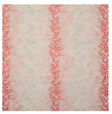
7125 Hojas | Coral