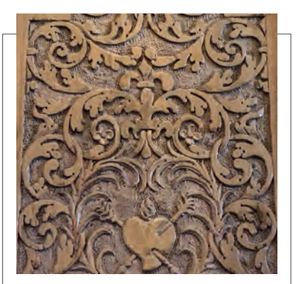
Inspiration for Renacimiento Ornate Wood Carving found in the lower South Duplex Suite