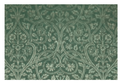
7129 Ferronerie | Verde