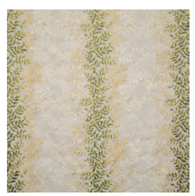
7125 Hojas | Peridot