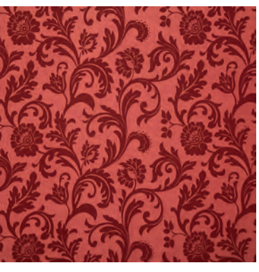
7123 Renacimiento | Lacquer