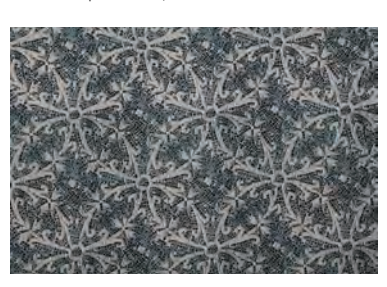
P6472 Esplanade | Sapphire