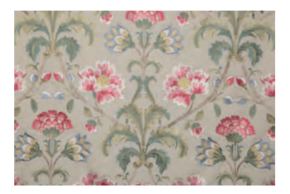
7126 Fiorito | Blossom