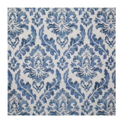
7124 Provenca | Sapphire