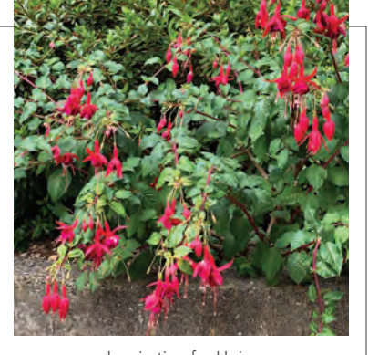
Inspiration for Hojas Bounty of Fuscia planted along the esplanade at Casa Grande