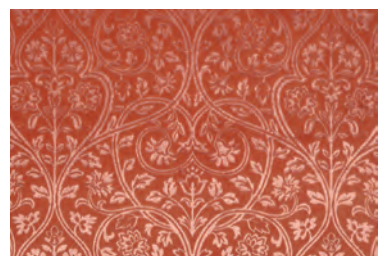
7129 Ferronerie | Marmelleta