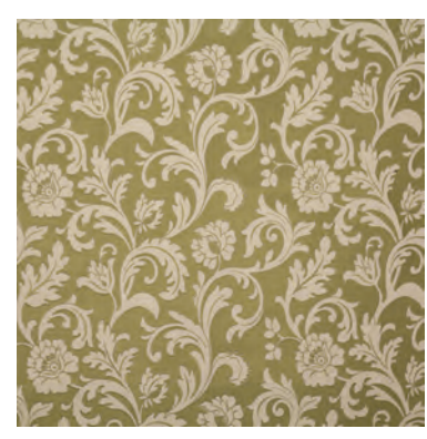
7123 Renacimiento | Peridot