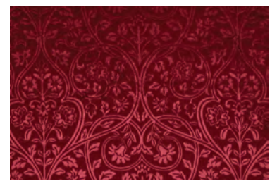
7129 Ferronerie | Ruby