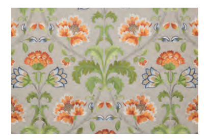
7126 Fiorito | Capri