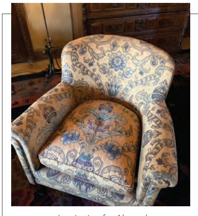
Inspiration for Alameda Armchair found in a Doge's Suite Bedroom

a new embroidery design, that features various techniques on a sateen ground cloth, and has both fresh and traditional multi-colored colorways. Alameda is