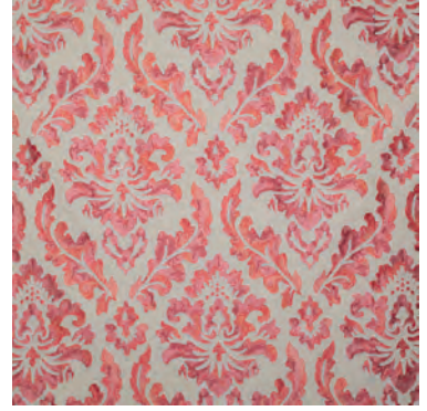
7124 Provenca | Coral