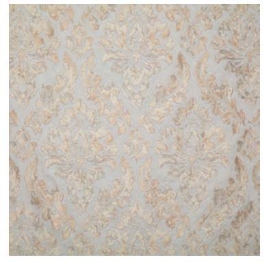
7124 Provenca | Champagne