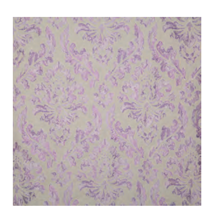
7124 Provenca | Wisteria