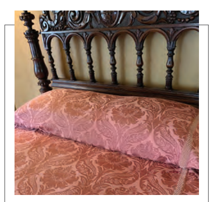
Inspiration for Provenca Bedspread found in Casa Del Mar