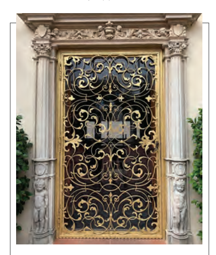
Inspiration for Ferronerie (above) Iron work on the front enterance of Casa Del Mar