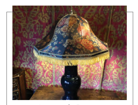
Inspiration for Fiorito Floral Shade of a Gilded Lamp