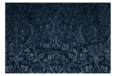
7129 Ferronerie | Sapphire