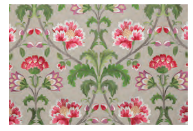
7126 Fiorito | Botanica