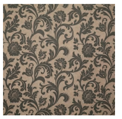
7123 Renacimiento | Greystone