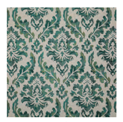
7124 Provenca | Emerald