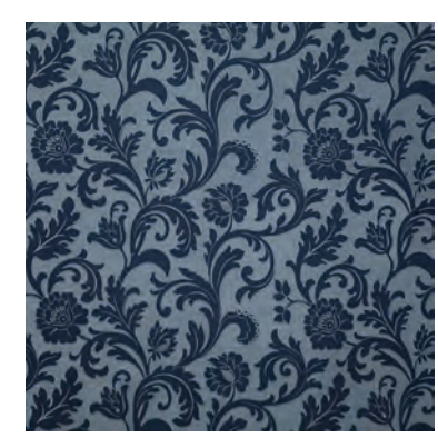
7123 Renacimiento | Sapphire