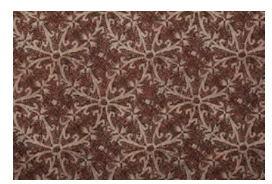
P6472 Esplanade | Mattone