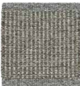
Silver Willow 551