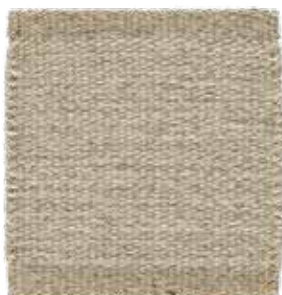
Sand Dune 882