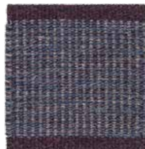
Dark Lavender 220