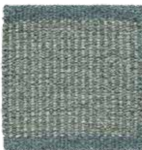
Ocean Mist 221