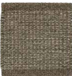
Pine Tree 880