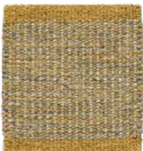
Golden Ash 450