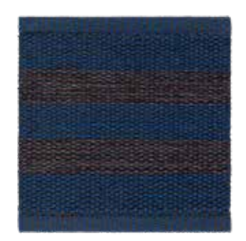
Indigo Dream 221