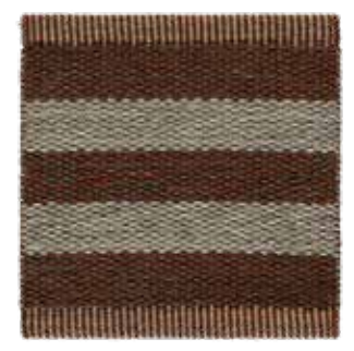
Red Clay 753