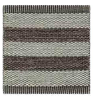
Silver Plum 560