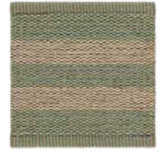
Bamboo Leaf 381