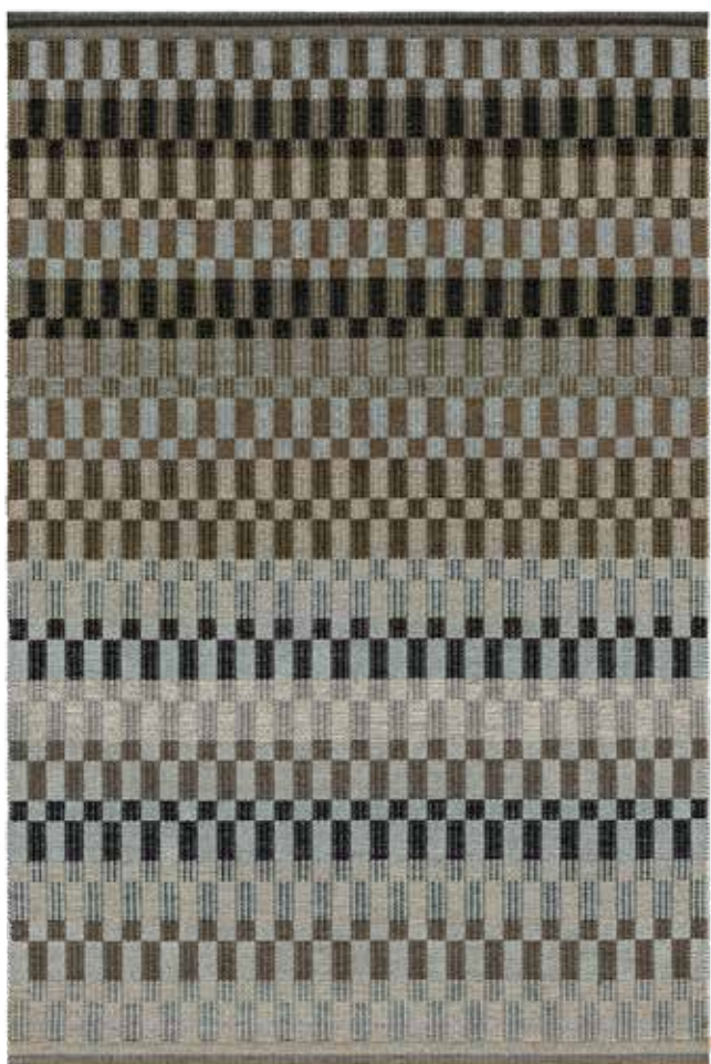
Rug 165x240 cm, Earth 200