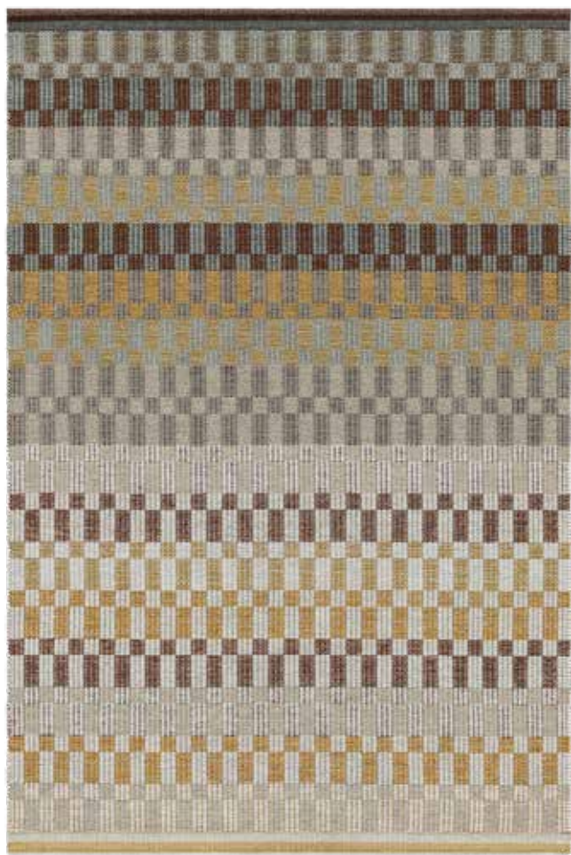
Rug 165x240 cm, Sun 400