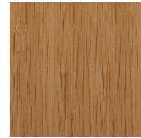
RWO-N: Rift White Oak, Natural